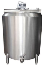
Milk Cooling Tank