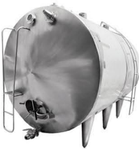
Milk Storage Tank