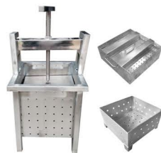
Paneer Press (Manual)