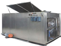
IBT (Ice Bank Tank)