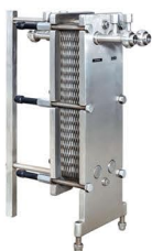
PHE (Plate Heat Exchanger)