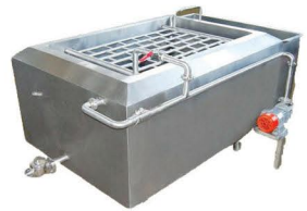
Butter Melting Vat