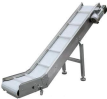
Inclined Belt Conveyor