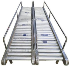
Gravity Roller Conveyor