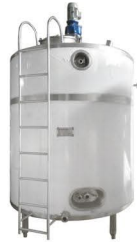
VMST - Vertical Milk Storage Tank