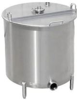
Ghee Balance Tank