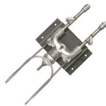
Steam Water Mixing Battery