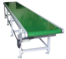
PVC Belt Conveyor