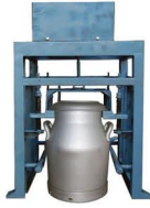
Can Lid Opener