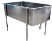
Can Lid Wash