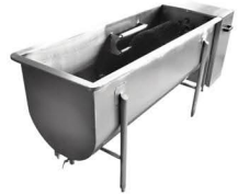
Milk Can Scrubber