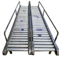
Gravity Roller Conveyor