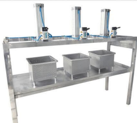
Paneer Press (Pneumatic)