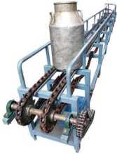
Milk Can Conveyor