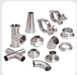
SS Pipe Fittings