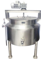
Ghee Storage Tank