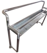
Can Drip Saver