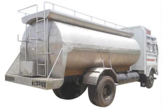
RMT - Road Milk Tanker