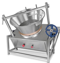
Khova Making Machine