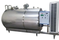
Bulk Milk Cooler