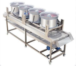
Cooling & Drying Conveyor