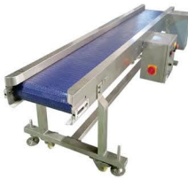
Modular Belt Conveyor