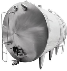
HMST - Horizontal Milk Storage Tank