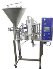
Cup Filling Machine